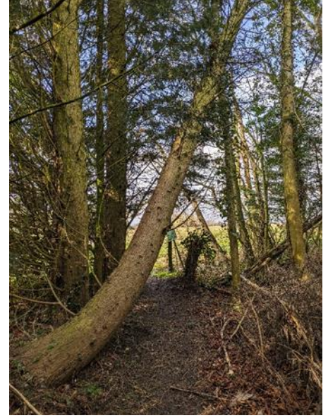
Fallen Trees on Footpath 1 making it more difficult to navigate after crossing the bridge near to Depden Green