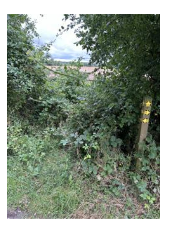
Footpath 4: (From near the Church, across the field joining Footpath 1 at Depden Hall) A short stretch of footpath from near the church heading towards the Village Green via Footpath 1