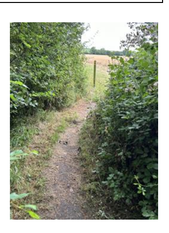
(Peter Elbens (01/07/2023)