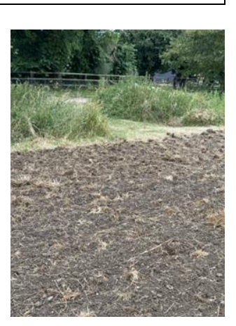
Footpath 5: (From Beech Hall behind Highweek joining Footpath 3) Starting from old A143 near to Beech Hall passing behind the Garden centre and joining footpath 3 This footpath is in good condition, well maintained and clearly signposted.