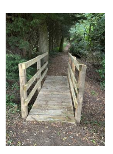
Footpath 2: (Footpath from old A143 road up to Church)

Starts from old A143 road and ends up at the church. This Footpath to the church is all clear, well maintained with no issues.